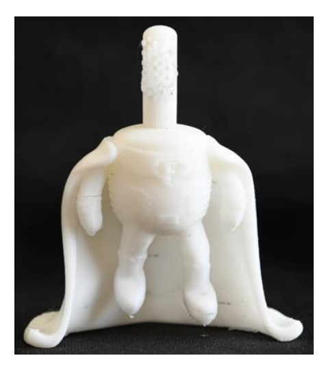
Figure 2. Final Prototype.