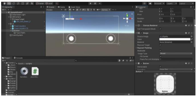
Figure 3. Unity programming environment

The application has two areas of knowledge: mathematics and reading. In the case of the mathematics area, it has a section on multiplications, divisions, additions, and subtractions, from which in an interactive way and interspersing objects, numbers, and animals, children will be able to learn and test their knowledge in the area of mathematics. , as shown in figure 4. You can choose any of the 3 levels of complexity.