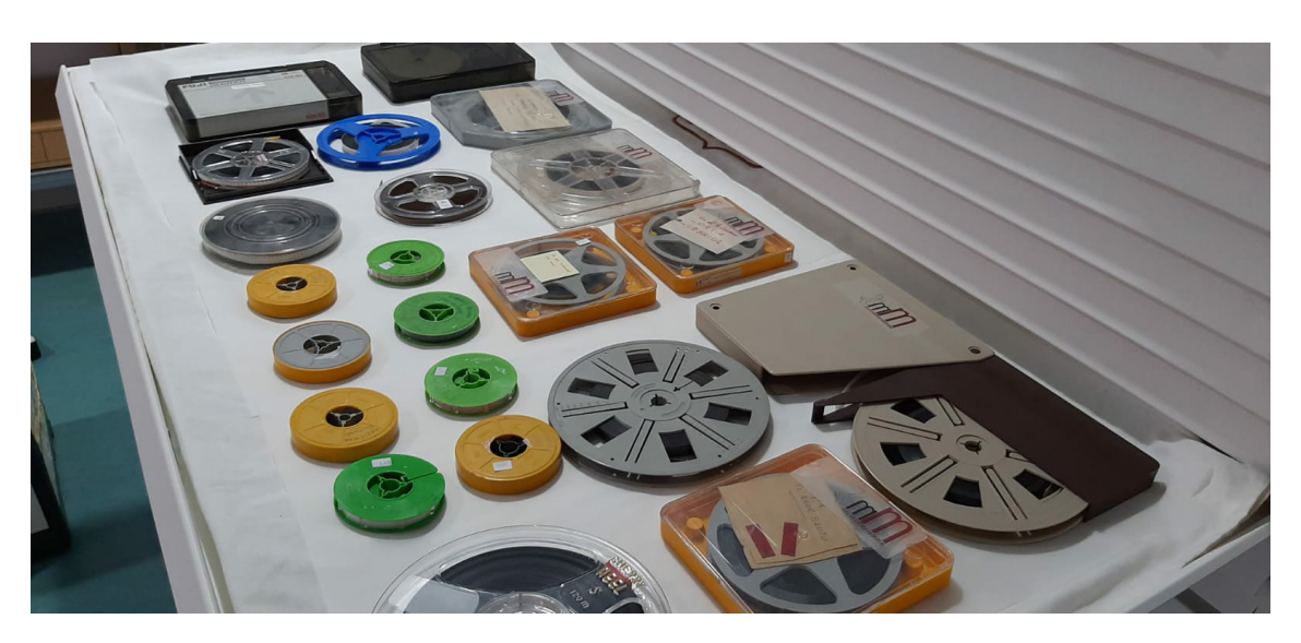
Figure 1. Film analog media, several sizes