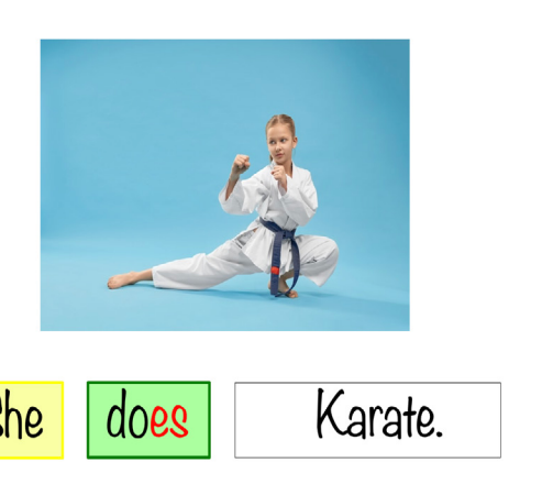
Figure 3. Sample power point slide SHE DOES KARATE 1