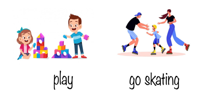
Figure 2. Sample power point slide ACTIONS 1