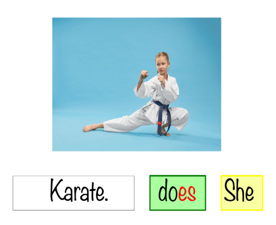
Figure 6. Sample power point slide SHE DOES KARATE 2