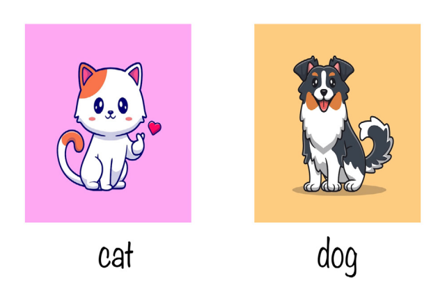
Figure 1. Sample power point slide ANIMALS 1