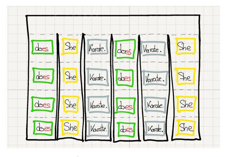
Figure 5. 'Seek and stick'