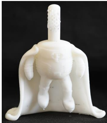
Figure 2. Final Prototype.